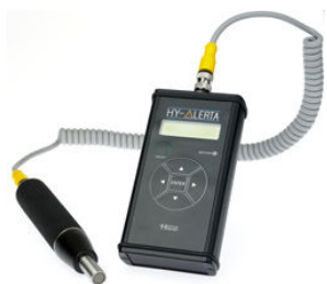
Model HY-ALERTA™ 500

During start-up of a hydrogen-cooled electric generator, air in the generator is replaced with CO 2 . This step is taken first so hydrogen is never added to air possibly reaching the LEL. After the generator is filled with CO 2 hydrogen is introduced until the generator is filled. With the hydrogen atmosphere intact, the generator can be started.