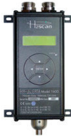
Model HY-ALERTA™ 1600

Hydrogen leaking into the area surrounding the hydrogen generator could make the containment room potentially explosive. HY-ALERTA™ 1600 installed in generator rooms will ensure safety operation of generators. Programmable alarms, relays and system integration are available options.