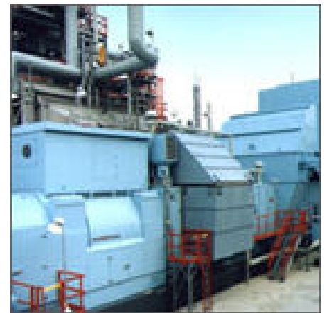
Figure 2: Typical generator cooled with Hydrogen

During shutdown, the hydrogen atmosphere in the generator is first displaced with CO 2 and then the CO 2 is displaced with Air. The Hydrogen level can be read during all phases of startup, running, and shutdown.