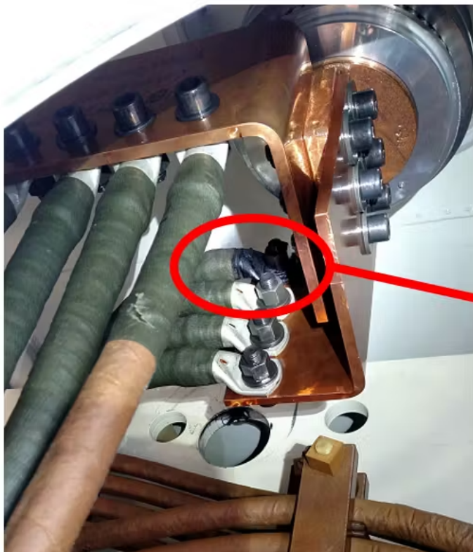
Figure 1. Hydrogen was generated in the transformer oil because of overheating on a low-voltage bushing connection owing to a loose nut on a 500-MVA generator step-up transformer. A hydrogen monitor alerted the owner to the problem. The transformer was repaired on-site.

In order to understand this, let's explore how transformers are designed today versus 40 years ago. Improvements in computer modeling, better materials, and another 40 years of experience have allowed transformer designers to significantly reduce the size of transformers. Although these factors have contributed to more efficient designs, global competition has been the real driving factor forcing manufacturers to drive out costs to become more competitive to stay in business.