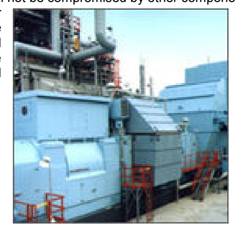
Figure 2: Typical generator cooled with Hydrogen

replaced with CO<sub>2</sub>. This step is taken first so hydrogen is never added to air possibly reaching the LEL. After the generator is filled with CO<sub>2</sub> hydrogen is introduced until the generator is filled. With the hydrogen atmosphere intact, the generator can be started.